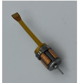
Fig. 1 Motor prototype without casing

Various tests and evaluations were carried out on critical functions, including the thermal resilience of the magnet, mechanical resistance of the shaft, adhesive application methods, sealing, coating encapsulation resistance and insulation. The feasibility of sensorless control was also investigated.