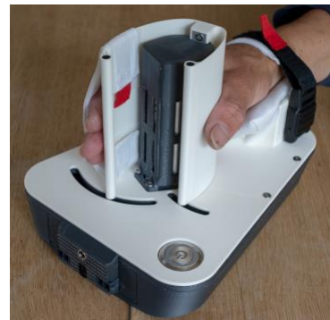
Fig. 2 Prototype with small shell and adjustable finger and wrist fixations for unsupervised sensorimotor hand training

A new finished device for unsupervised training was developed, which can be used to safely and intuitively train grasping movements in stroke patients with different hand sizes. Haptic rendering enables somatosensory training in addition to motor functions in a motivating virtual environment. An improved transmission reduces friction and play. A simple and clean design improves its use intuitiveness, while different shell sizes ensure maximum comfort and correct movements during training. Shells can quickly be changed without special tools. To ensure safety, the device covers, which prevent any pinching of the fingers, snap into place with magnets. By tilting the device, small pronosupination movements were allowed, and by using an IMU those movements can be employed for easy navigation on virtual reality games.