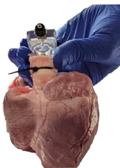
Fig. 1 Experimental test on an ex-vivo porcine heart.

Multiple measurements were conducted on three prosthetic valves (mechanical bileaflet, mechanical monoleaflet and bioprosthetic) to evaluate and improve the VL-device. Then an ex-vivo porcine aortic heart valve was tested to validate the device. The leakage was quantified with the VL-device on the competent native valve with pressure going up to a maximum of 129.9 mmHg. The valve was then damaged by incising a leaflet to mimic an incompetent valve. The leakage was again determined and compared to the native valve.